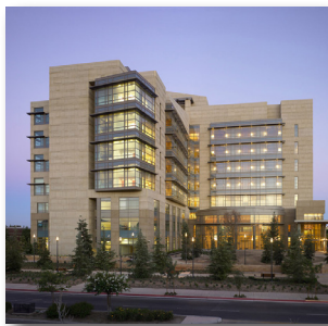
Robert E. Coyle Federal Courthouse